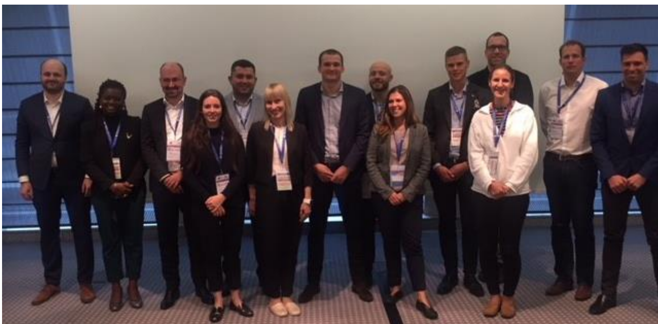
YP Steering Committee - meeting in Berlin

Bulgaria, Czech Republic, Denmark, Estonia, Finland, Germany, Hungary, Italy, Norway, Poland, Romania, Serbia and The Netherlands are represented in the YP Steering Committee.